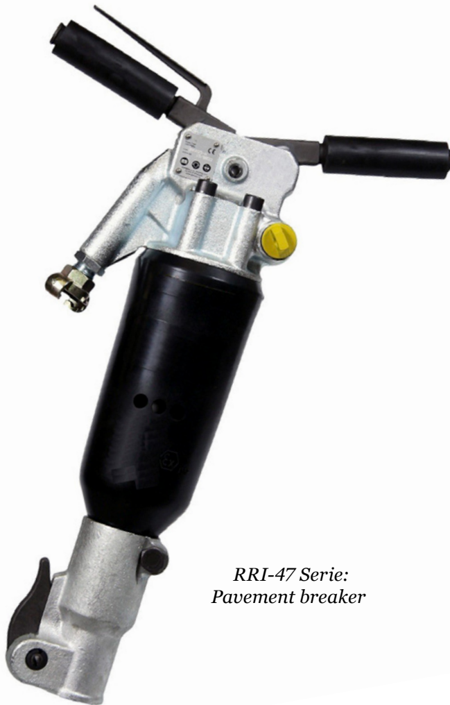
RRI-47 Serie: Pavement breaker

This RED ROOSTER INDUSTRIAL pavement breaker has a chisel retainer with latch. Suitable for endured usage. High energy level each blow. For applications in construction and renovations.