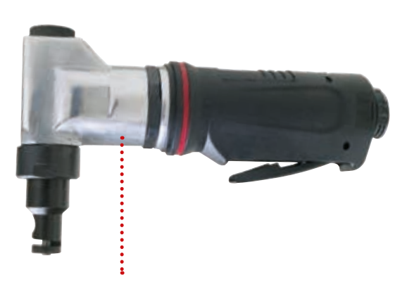
The head can be adjusted in four steps of 90°: basic / 90° / 180° / 270°

The Red Rooster RR-8116 nibblers are quick, easy to maneuver to cut circles, curves and corners in sheet metal and bodywork. Also ideal for wavy and round / convex sheet metal work. The cut sheet metal is not deformed. The head can be adjusted in four steps of ninety degrees to fit perfectly to the workpiece.