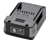
Battery 18V 2 AH (BPL-1820)