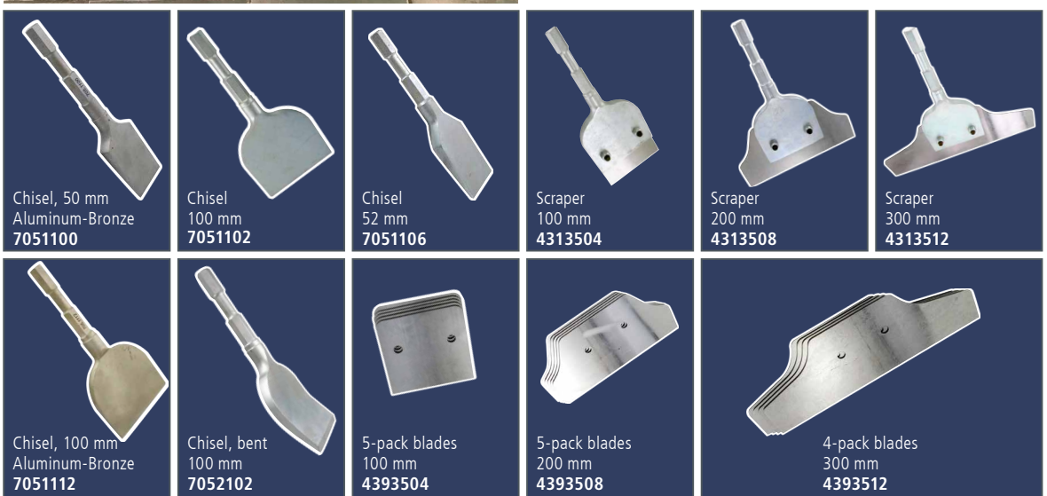
Chisel, 50 mm Aluminum-Bronze 7051100